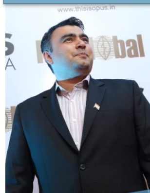
Gagan Narang, 2012 London Olympic Silver Medalist.