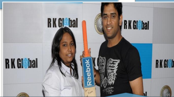
Received M S Dhoni's World Cup 2011 Winning Bat , proceeds of Rs 72,00,000 going to Mahendra Singh Dhoni Charitable Foundation.