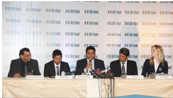
R K Global's Press Conference for Product Launch & declaration of Guinness World Records entry.