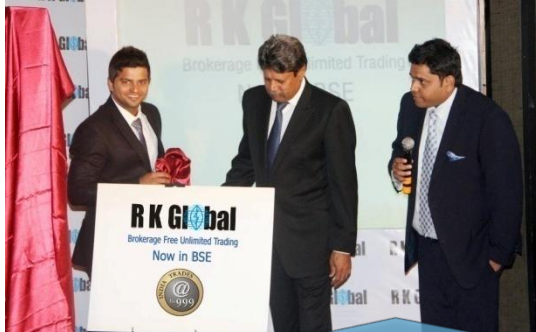
R K Global launches Brokerage Free Unlimited Trading Plan “India Trades@ Rs 999” in BSE Cash Market.