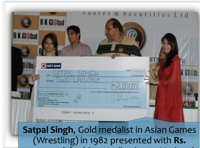
Satpal Singh , Gold medalist in Asian Games (Wrestling) in 1982 presented with Rs. 2,00,000/- for his contribution to National sports.