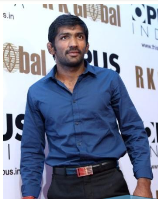
Yogeshwar Dutt, 2012 London Olympic Bronze Medalist.